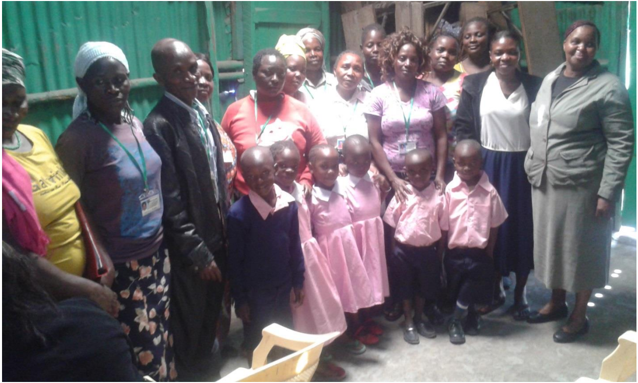
Figure 3: Mapatano SFL group giving back to the community (New school uniforms for needy children) during their share out. This is to show that the community members can resolve all the problems surrounding them if and when they come together for a common goal.