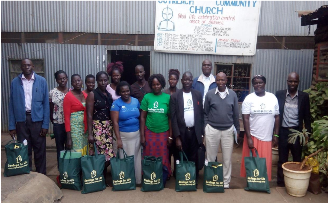
Figure 1: MCO-SFL Community Agents taking home incentives after their monthly meeting of performance review. We are empowering the community to empower others as well.