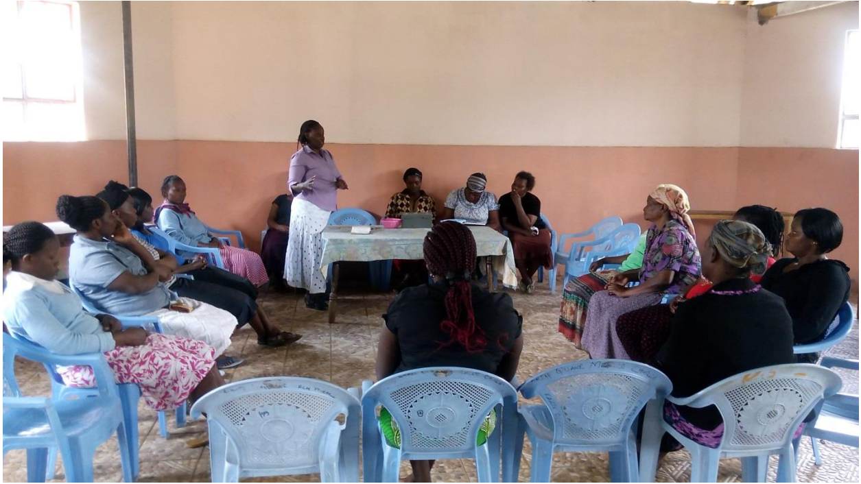
Figure 4: A group of women having their weekly meetings. Most women are now joining the groups and taking up leadership positions to make decisions both at the group and at home.