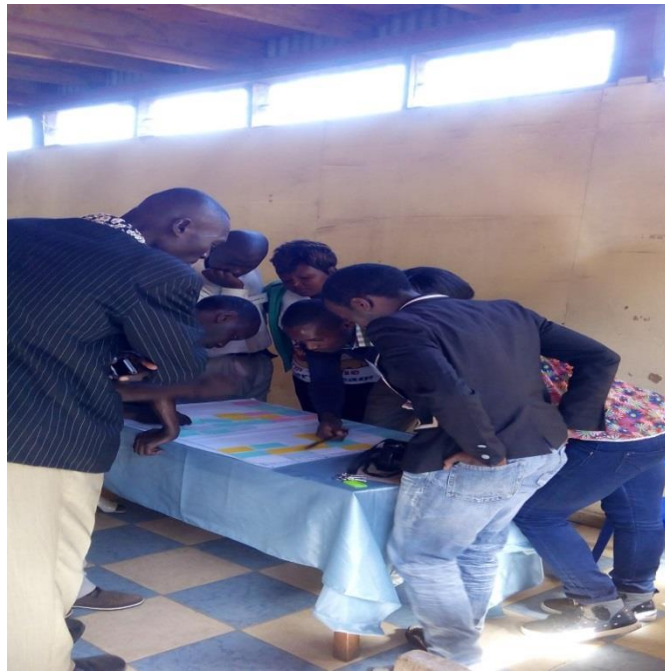
Figure 2: A section of Community Agents being trained by a Field Officer during their training.